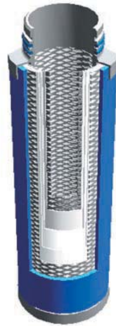
Cross section of the depth filter

By utilising various filtration mechanisms such as retention by direct impact, sieve effect and diffusion effect, liquid aerosols and solid particles down to the size of 0.01µm are being retained in the filter.