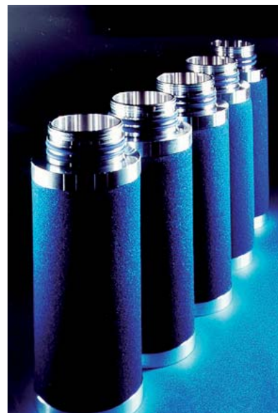
Depth Filter SMF