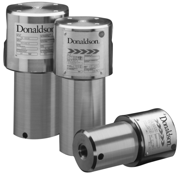
HD High Pressure Filter Housings

HD housings are available in eight different sizes, ranging from 1/4" to 2" FNPT, and pressure rating 925 psig and 5,800 psig. The HD High Pressure Filter Housings are designed in accordance to ASME VIII, Division 1. Housings are available in aluminum, stainless steel, and carbon steel.