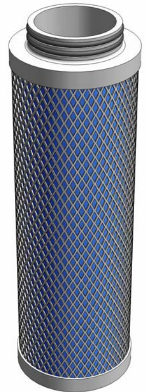
Synteq XP depth filter