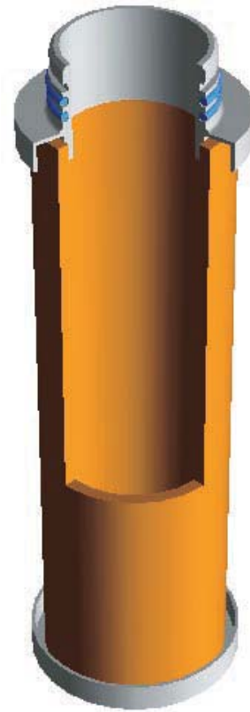
Cross section of the depth filter

The high-grade sinter bronze medium guarantees not only a high load of contaminants but also the regeneration of the filter element.