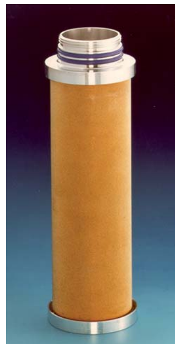
Depth filter SB