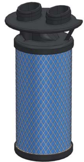
Depth Filter UltraPleat® S