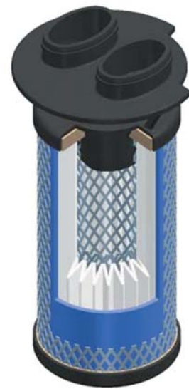
Cross section of the depth filter

By utilising various filtration mechanisms such as retention by direct impact, sieve effect and diffusion effect, liquid aerosols and solid particles down to the size of 0.01µm are being retained in the filter.