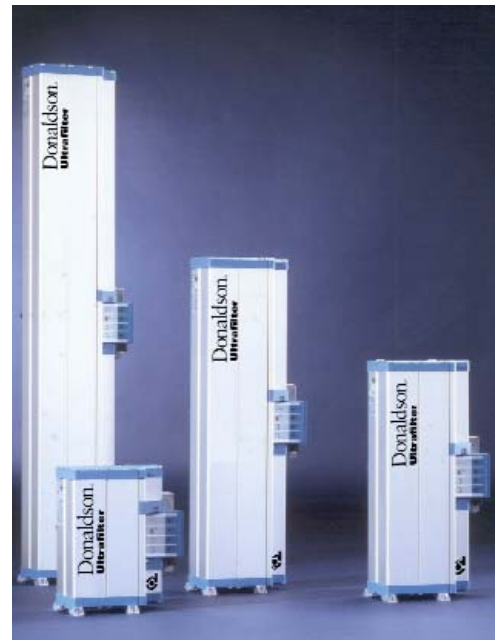
Oilfreepac® 2000 Standard

The final particle filter (3) removes all particles which might be carried over from the adsorption stages. While one vessel with desiccant cartridges is in the drying phase (adsorption), the other cartridge is being dried again (regeneration). A partial stream of dried air is expanded to atmospheric pressure via an orifice (6) and led across the desiccant cartridge for regeneration and via a solenoid valve and a silencer system to atmosphere.